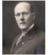
Rtn. Paul Harris Founder