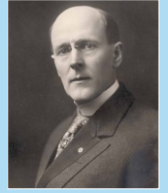
Rtn. Paul Harris Founder